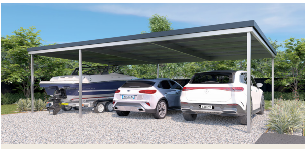
5.9m long x 8.9m wide x 2.4m high, triple carport

8. Ideal Buildings reserves the right to withdraw this offer at any time without notice. 9. All advertised product images are illustrative only. Actual product may vary. 10. All prices and savings include GST. 11. Savings are based off the applicable list price for the relevant building as offered by the relevant participating Ideal Buildings distributor. 12. Ideal Buildings endeavours to ensure that the information contained in its advertising, including images, prices, savings, and descriptions, is correct, but does not accept any liability for errors, omissions, or differences between the products shown and finished products. 13. © Copyright Spanbild New Zealand Limited, 2024.