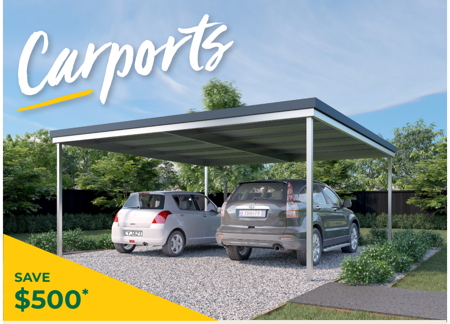
5.9m long x 5.9m wide x 2.4m high, double carport