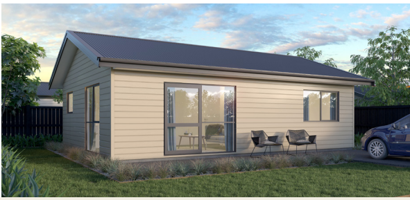
Clevedon, two bedrooms, 9m long x 6.6m wide