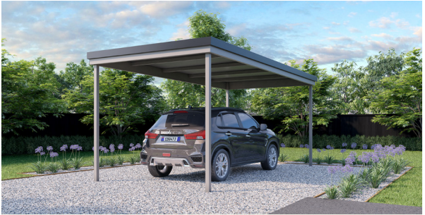
5.9m long x 2.9m wide x 2.4m high, single carport